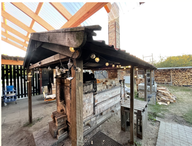
Wood Burning Kilns