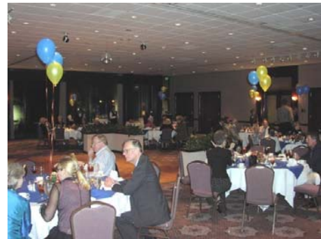
Table Hopping Was Fun in the Ballroom

BraeBurn Country Club is located 8101 Bissonnet Street, Houston, TX 77074 (713) 778-3824 See Map Page 7