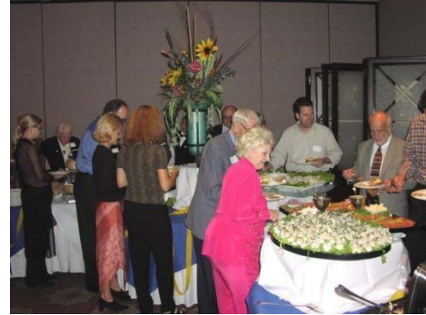
The first table at BraeBurn

PRICE: Pre-registered Club members=$25 Non-Members and door price = $30 Children 12 and younger= $10