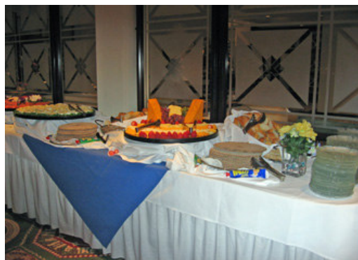
The cold foods table was set with a beautiful array.