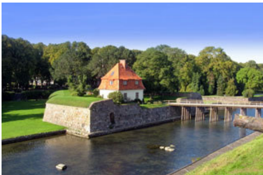
View from the Castle in Kalmar