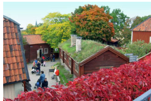
Fall colors at Skansen