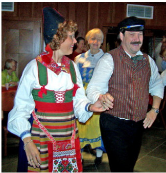
The Scandinavian Folk Dancers entertained everyone with several traditional dances last year.

On Saturday, December 13, all over Sweden, in homes and auditoriums and parish halls, girls will be dressing in white, full-length chemises, with red ribbons around their waist and an evergreen wreath with candles on their heads. They will be accompanied by similarly dressed attendants and by "star boys," singing the traditional Lucia song as they process with their hands devoutly pressed together in front of them.