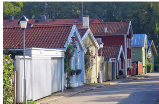
A quiet morning street scene in Kalmar