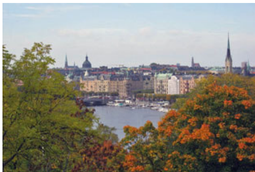
The open-air museum, Skansen, is a great place to take in the autumn beauty of Stockholm.