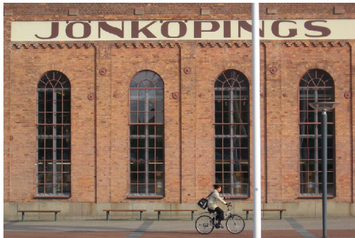
Jönköping International Business School