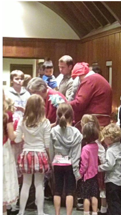
Tomte has arrived!