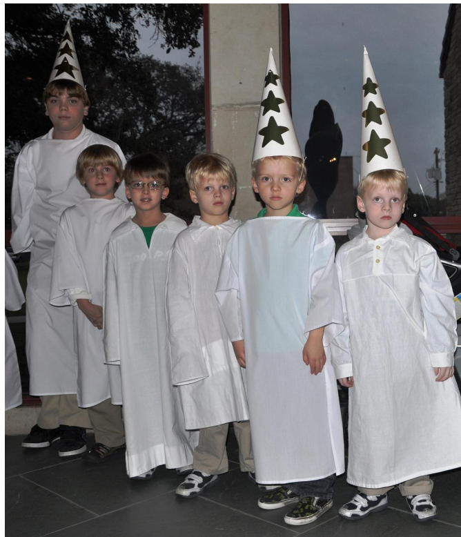
The Star Boys waiting to join the procession.