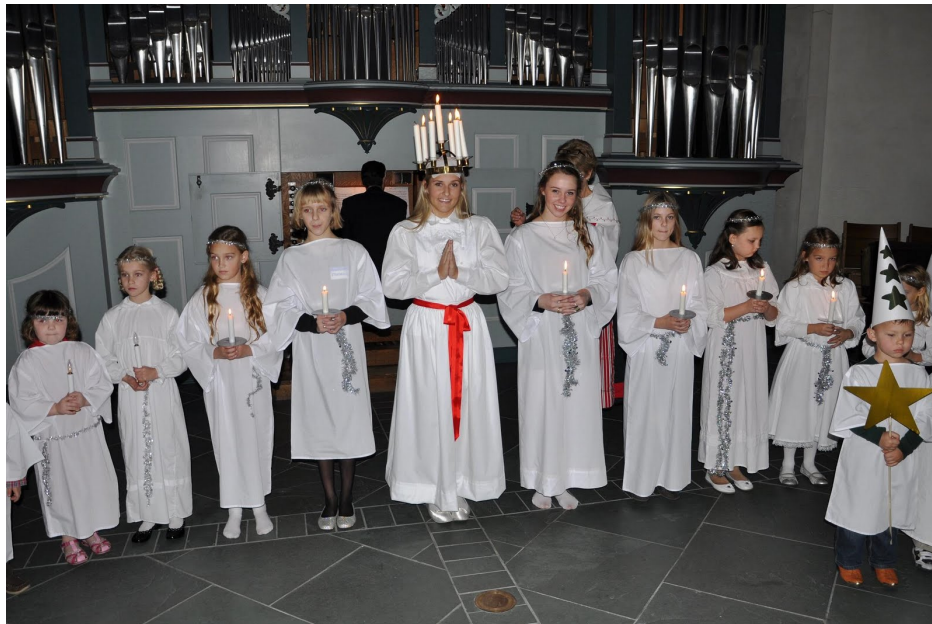
The Star Boys, attendants, and Lucia together during the service.