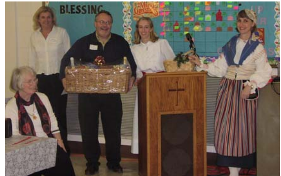
Say Thanks to IKEA at 7810 Katy Freeway (The Blue & Gold Building at Antoine & IH10)