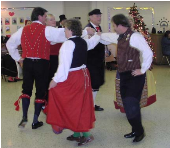
Gulf Coast Scandinavian Dancer showing us folk dances

As always the GC Scandinavian Dancers performed and involved the guest in their wonderful renditions of Swedish and other Scandinavian folk dances.