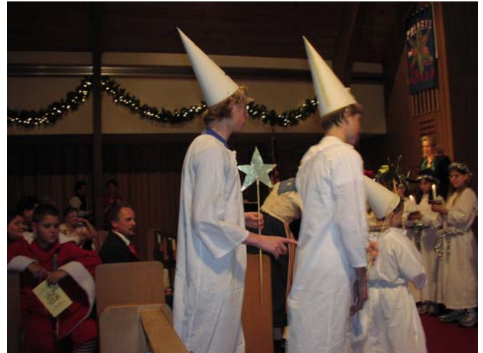
3 Star Boys

and the presence of a young Jul Tomte passing out candy canes.